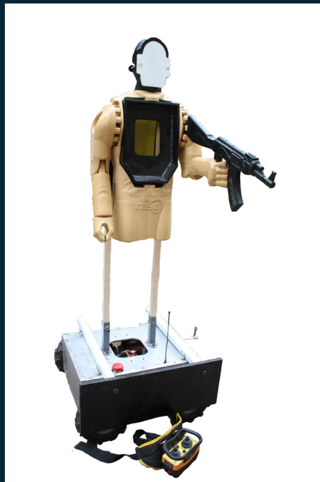
TAT3D MARIO SF (with a bullet trap made of ARDOX 500)

For enquiries: TP ITALIA SRL, Via Brunico 10 21100 Varese (VA) ppluchino@odintacticalgear.com +39 345 756 7560 NATO NCGE: AQ401