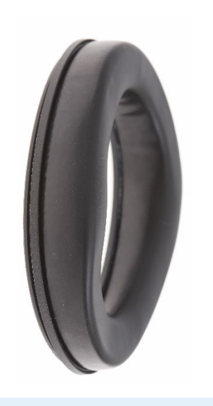
1,000 MRI cranial scans were analyzed to create the new ergonomically shaped 3D cushion.

The INVISIO T7 is the first headset of its kind to withstand both high altitudes and diving environments.